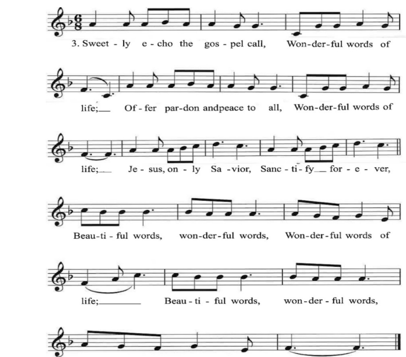
Won - der - ful words of life.